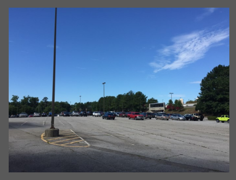
WESTERN MARTA PARKING LOT